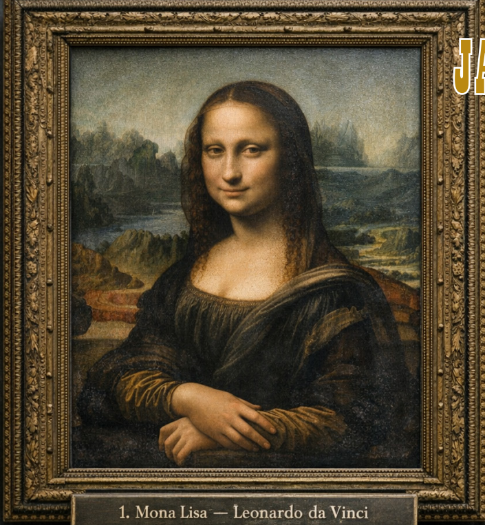
1. Mona Lisa — Leonardo da Vinci Musée du Louvre, Parijs, Frankrijk